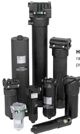
High Pressure heavy-duty filters rated for pressures up to 6500 psi for critical applications.

With Donaldson protection, your equipment will operate longer between filter replacements, saving on costly downtime and repairs. And we have a full range of offerings – both housings and replacement filters – to cover a wide range of underground mining equipment.